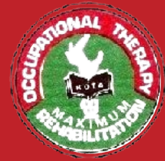
KENYA OCCUPATIONAL THERAPISTS ASSOCIATION